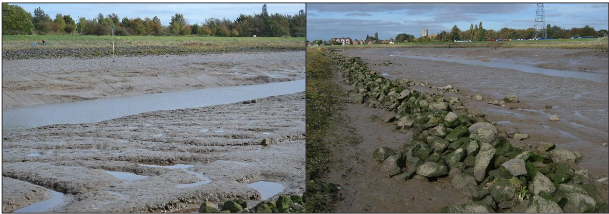
Plate 17-1 Mudflats adjacent to the Principal Application Site. Photographs taken by RHDHV on 8th October 2018.

17.6.8 The October 2018 site visit confirmed that the habitats surrounding the proposed wharf location consist of shallow mud banks on either side of The Haven, with the middle of the channel being approximately 4 m below the level of the shore. The width of the mudflats on either side of The Haven is approximately 15-20 m, with the slope of the mudflats steepening nearer the middle of the channel ( Plate 17-1 ). A biotope map of the European Nature Information System (EUNIS) habitats in The Haven confirms the presence and extent of the mudflats along The Haven ( Figure 17.2 ).