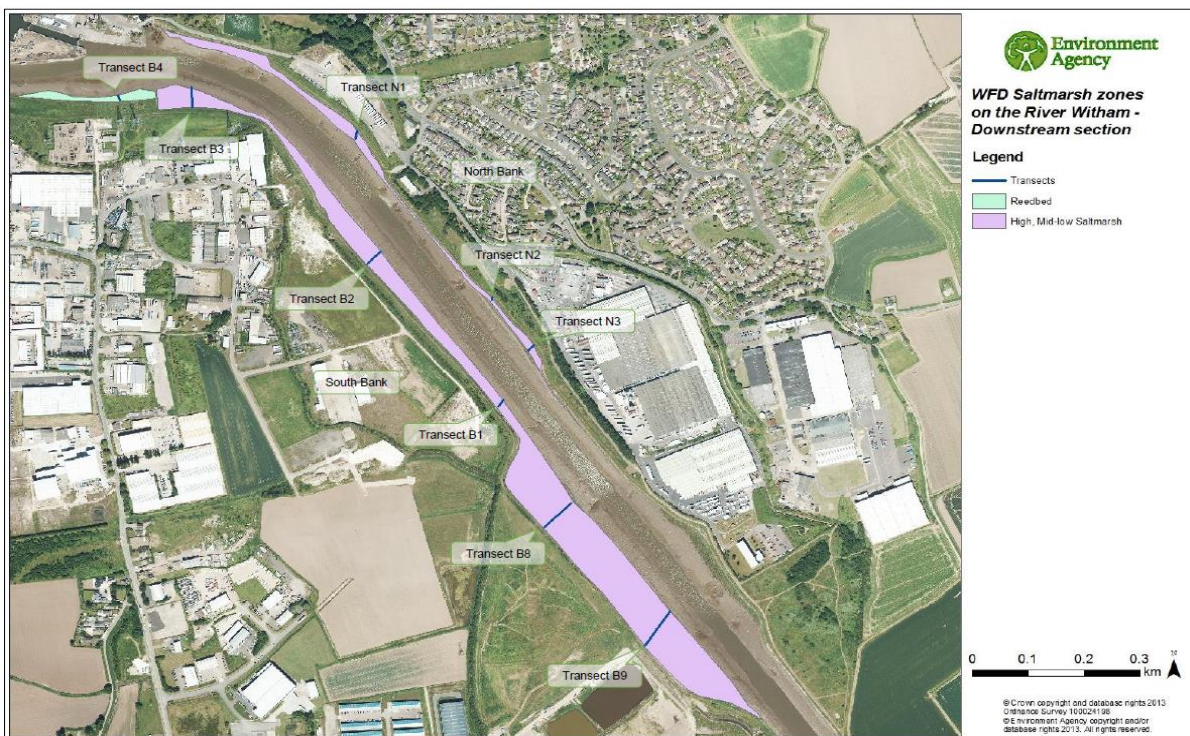
Plate 17-3 Saltmarsh areas surveyed by the Environment Agency – Transects B1 and B2 on the South Bank are the closest to the Principal Application Site.

17.6.12 The most recent survey (Holden, 2017) recorded 18 saltmarsh species in 2017, compared to 19 in 2014 and 17 in 2011 ( Plate 17-3, Figure 16.3 ). The two transects taken in 2017, classified the saltmarshes to the north of the Project as SM13a Puccinellietum maritimae saltmarsh, Puccinellia maritima dominant sub-community (mid-low marsh), SM24 Elymus pycanthus ( Elytrigia atherica ) saltmarsh, dominated by Elytrigia atherica (high marsh) and SM10 transitional low marsh vegetation with Puccinellia maritima , annual Salicornia species and Suaeda maritima (Joint Nature Conservation Committee's (JNCC) National Vegetation Classification). The saltmarshes to the south of the Project site were classified to be SM16d tall Festuca rubra sub-community (high marsh), SM13a Puccinellietum maritimae saltmarsh, Puccinellia maritima dominant sub-community (mid-low marsh), SM13d Puccinellietum maritimae saltmarsh, Plantago maritima - Armeria maritima sub-community (mid-low marsh) and SM10 transitional low-marsh vegetation with Puccinellia maritima , annual Salicornia species and Suaeda maritima .