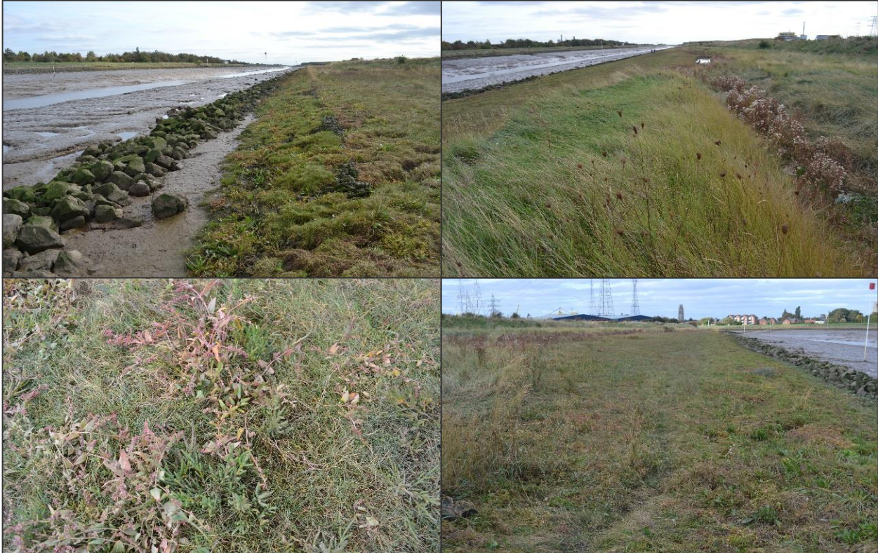
Plate 17-2 Saltmarshes adjacent to The Haven and the site of the proposed Principal Application Site.

17.6.10 The intertidal saltmarshes on either side of the channel are approximately 10-30 m wide, stretching from the base of the flood defence embankment to a small wall of boulders where the mudflats begin. The key species recorded on the saltmarsh were Salicornia sp., Spergularia sp., the sea lavender Limonium vulgare , alongside improved grassland species ( Plate 17-2 ).