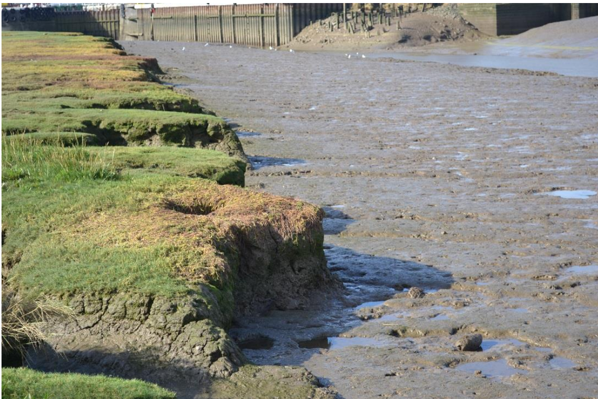
Plate 17-5 Erosion of the saltmarshes upstream of the location of the Principal Application Site.

17.8.161 Hence, as a worst-case scenario, it is assumed that the heights and periods of waves created by an individual vessel in The Haven are above the threshold for the erosion of mud from the intertidal areas and that the increase in the shipping traffic would result in an increase in erosion.